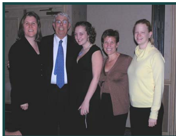
Celebrating at Saturday Night's Award Dinner.