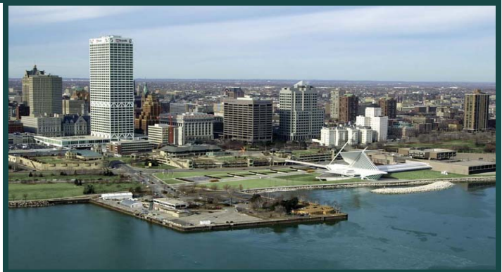
Picture of Downtown Milwaukee, Site of 2009 ILA Convention