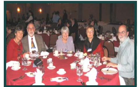
We're Having Fun Now.