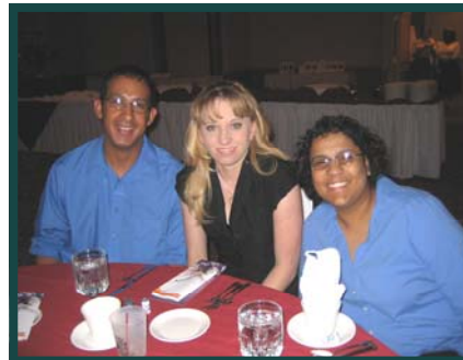
Some Student Members Pose.