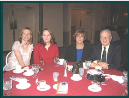
Enjoying Saturday Night's Dinner and Awards Ceremony