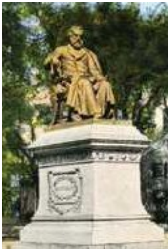
Statue of Longfellow that sits at Longfellow Square in Portland, Maine