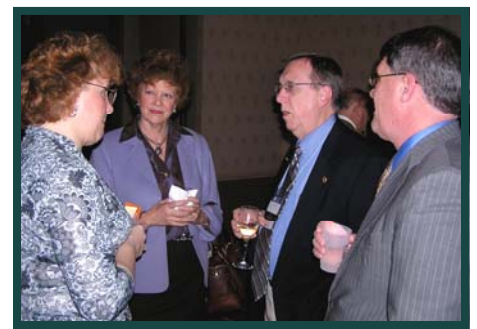
Enjoying One of Several Social Hours.