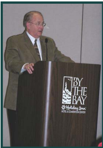
Manny's Keynote Opened 29th Convention.