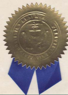
Edward J. Suslovic, Mayor City of Portland, Maine

Signed and sealed this 1st day of March, 2008