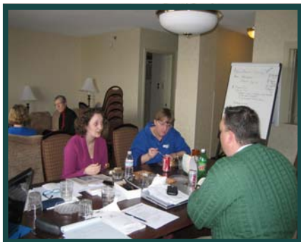
Board Members Take a Break from their Pre-Convention Meeting.