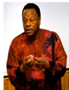
Molefi Kete Asante