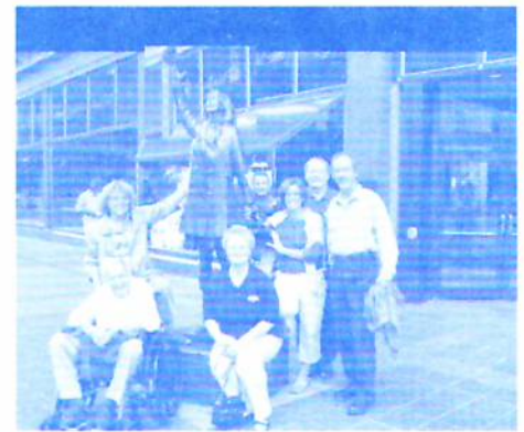
ILA Board meets in Minneapolis, MN, September 17-19, 2004 Photo at Nicollet Mall with the statue of Mary Tyler Moore throwing her tam