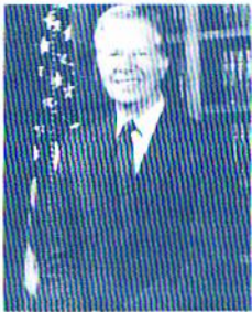
President Jimmy Carter ILA Listener of the Year

This year's recipient served as the U.S. President from January 20, 1977 to January 20, 1981. Because of his unselfish efforts as a negotiator for peace and humanity, his years of service in roles where listening is a key component, and his example to the world, as well as to us, his fellow countrymen, the ILA Awards committee presented President Jimmy Carter for Listener of the Year.