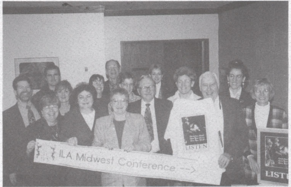
Attendees at the Midwest ILA Regional Conference. Regional Conferences are a wonderful way to continue your ILA connection. Watch the Post and your mail for information about upcoming regional conferences.

"There is a new direction for the ILA Education Pre-Conference. The pre-con-