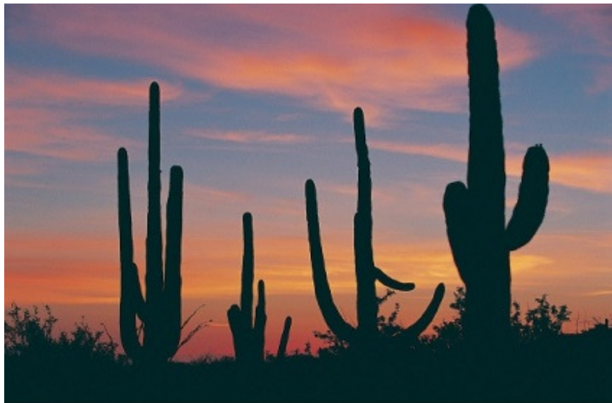
SCE 877 Saguaro with Sunset