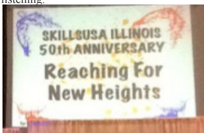
The first Effective Listening contest was held in conjunction with SkillsUSA's and Illinois SkillsUSA's 50 th anniversary.