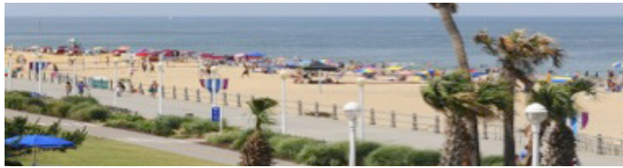
Virginia Beach

At the annual convention in Virginia Beach, we will be showcasing a new listening contest for SkillsUSA members. A few student participants will be observed as they compete. We are doing so to allow ILA members an opportunity to provide feedback before the ILA Board decides whether to have the ILA sponsor this contest throughout the U.S. And once approved, we want our ILA members to get this Effective Listening contest to their states' SkillsUSA chapters.