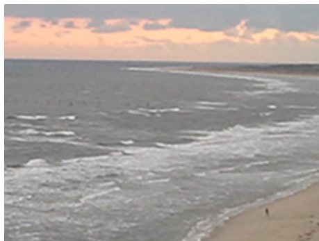
Sunrise in Virginia Beach

The Virginia Beach Resort Hotel & Conference Center 2800 Shore Drive Virginia Beach, VA 23451 (757) 481-9000 or (800) 468-2722 (Toll-Free)