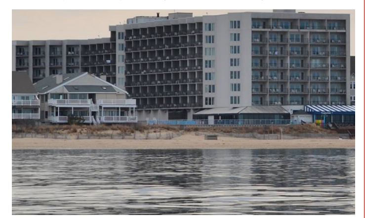
The Resort at Virginia Beach for the 2015 ILA convention

Additional information, including proposal submission guidelines will be available on the ILA website, (www.listen.org) soon but don't wait; share your ideas by emailing me at ListenUSA@gmail.com.